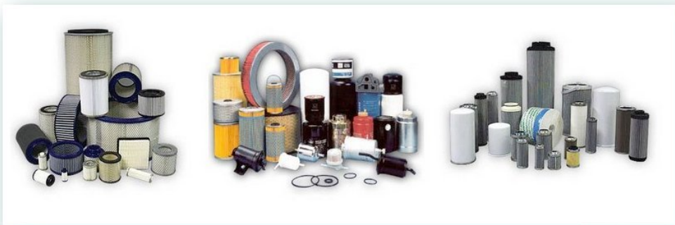
Filtr hydrauliczny zam. HF28813 F4