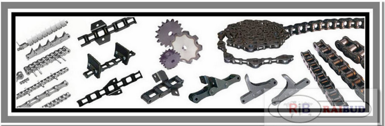
Łańcuch rolkowy 12B-1