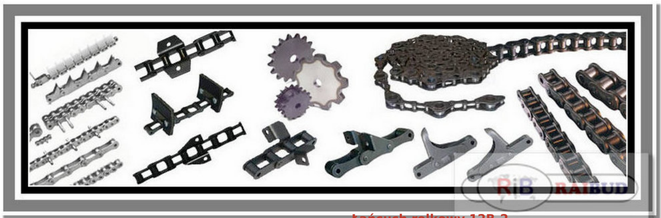
Łańcuch rolkowy 12B-2